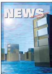
Imagination included – New HPLC system LC-20A prominence