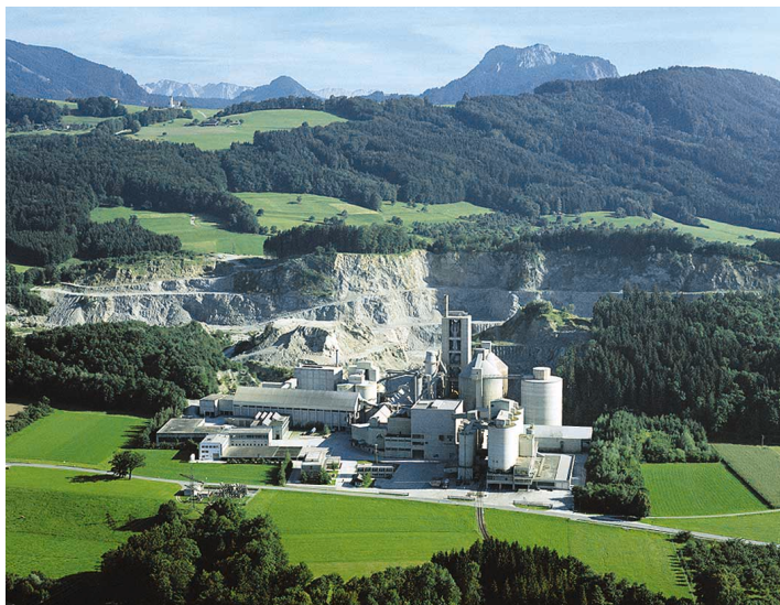
The Portland cement plant in Rohrdorf

Windows is a Trademark of Microsoft Corporation.