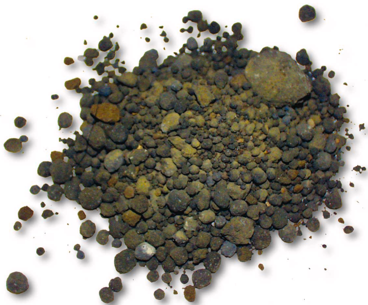
The product 'clinker'

Waste tyres are being added in shredded form – the maximum length is approximately 30 cm – together with paper scavenger materials through a 3-valve lock system in the ascending shaft of the heat-exchange tower.