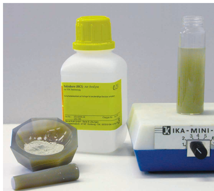
Figure 2: Sample preparation procedure

For adequate TOC measurements of the relevant materials used during cement manufacture, the quantitative separation of the