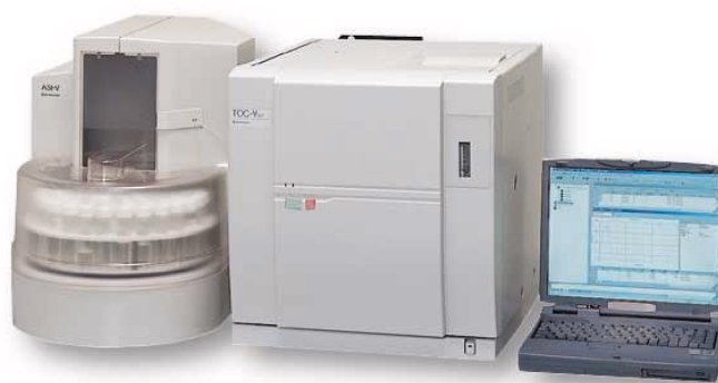
The TOC analyser TOC-V CPN with ASI-V autosampler

The set-up shown in Figure 2 symbolises the total sample