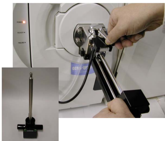
Fig. 1: Direct Introduction Probe (lower left) and Inserting the Probe into the MS Unit

The direct introduction probe is shown in Figure 1 and a diagram of the principle is shown in Figure 2. The sample is dissolved in a solvent and inserted into a glass sample cup placed on the end of the probe. After drying the solvent, the probe is inserted into the mass spectrometer (MS) ion box. The sample is introduced to the ion source box by heating the sample cup with a heater, and then ionized by electrons emitted from a filament.