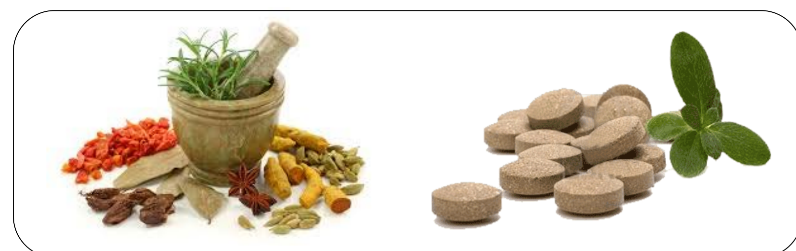
Figure 1 Ayurvedic plant resources and tablets

The objective of this study is to develop a sensitive, selective, accurate and reliable method using Shimadzu ICPMS-2030 to determine the heavy metals from ayurvedic tablets.