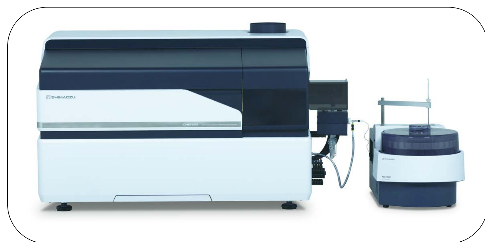
Figure 2 Shimadzu ICPMS-2030 Inductively coupled plasma mass spectrometer