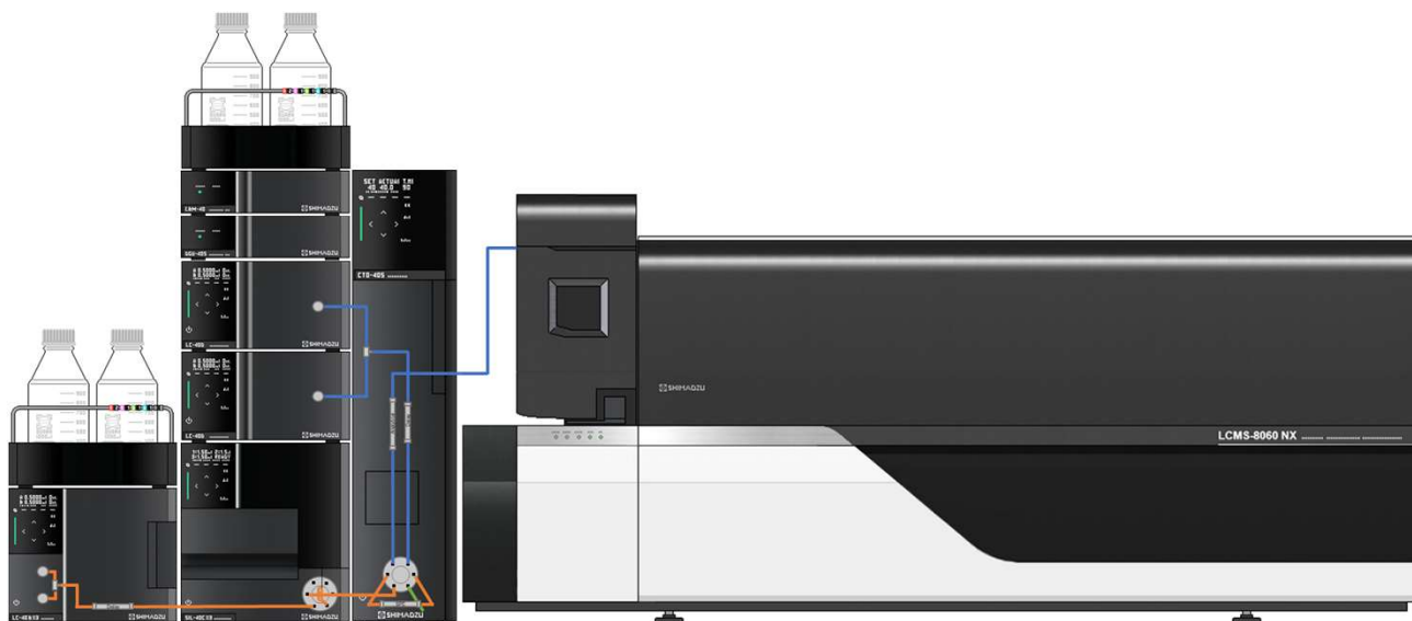
Figure 3 Scheme of the Nexera on-line SPE LCMS-8060NX system