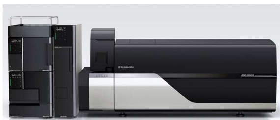
Figure 1 LCMS-8060NX coupled to a Nexera X3 system

To minimize adsorption of (especially long chain) PFAS to the surface LabTotal Vials (P/N 227-34001-01) with PP-caps, with aluminium septa (P/N 961-10030-31) were used.