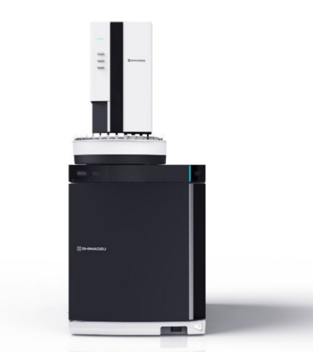
Figure 1: GC-2050 with AOC-30i autosampler.