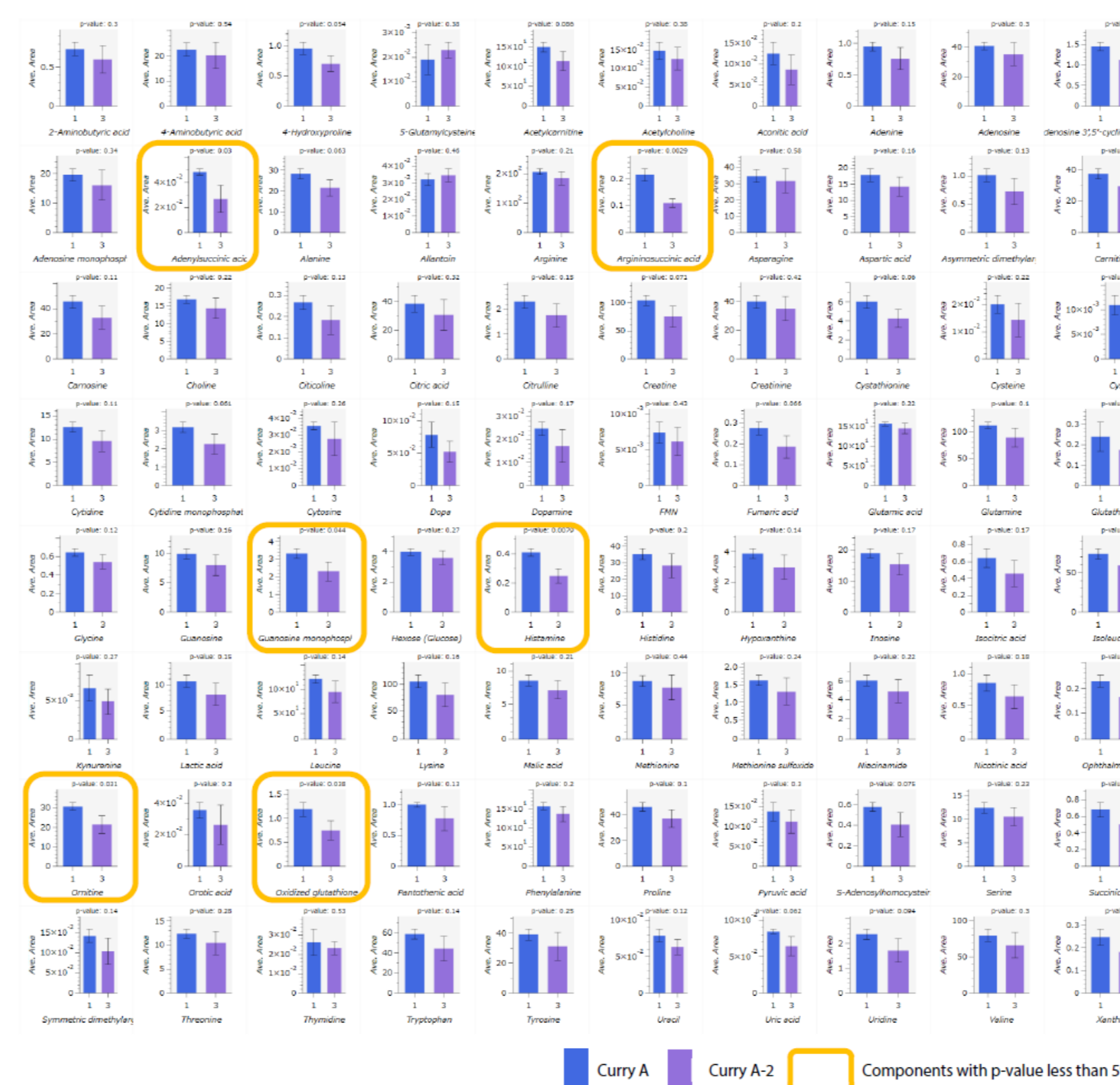
Figure 3 t-test Results for Curry A and Curry A-2

The amounts of 6 metabolites (adenylsuccinic acid, argininosuccinic acid, guanosine monophosphate, histamine, ornithine and oxidized glutathione) in Curry A sauce were obviously higher (p < 0.05) than those in Curry A-2 sauce. It was thought that there was not much elution from ingredients to sauce and change of hydrophilic compounds in sauce even if curry was stored overnight after cooking.