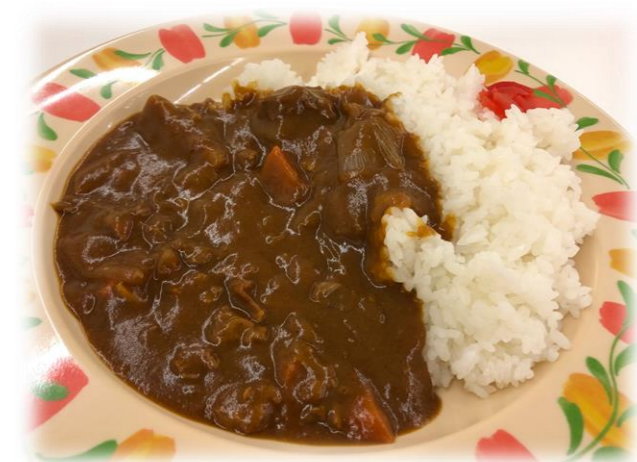
Figure 1 Curry C