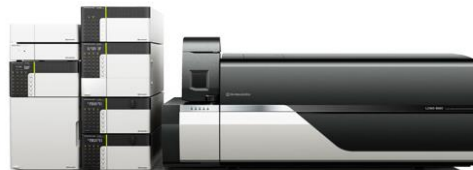
Figure 2 Nexera X2 + LCMS-8060

Ionization: ESI (Positive/Negative, MRM mode) DL temp.: 250°C HB temp.: 400°C Interface temp.: 400°C Nebulizing gas: 2.0 L/min Drying gas: 10 L/min Heating gas: 10 L/min