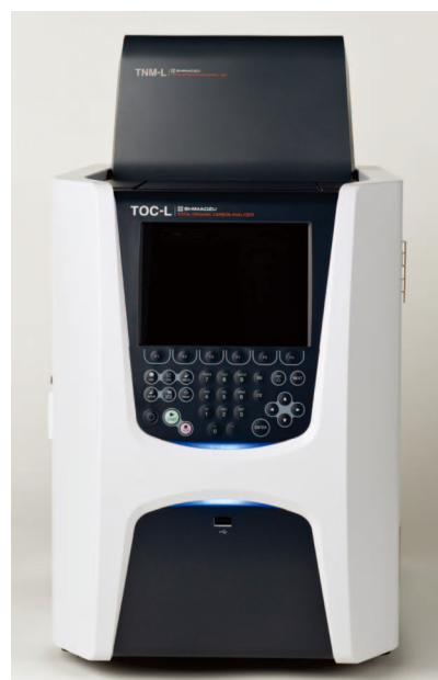
Fig. 3 TOC-L Total Organic Carbon Analyzer + TNM-L Total Nitrogen Unit