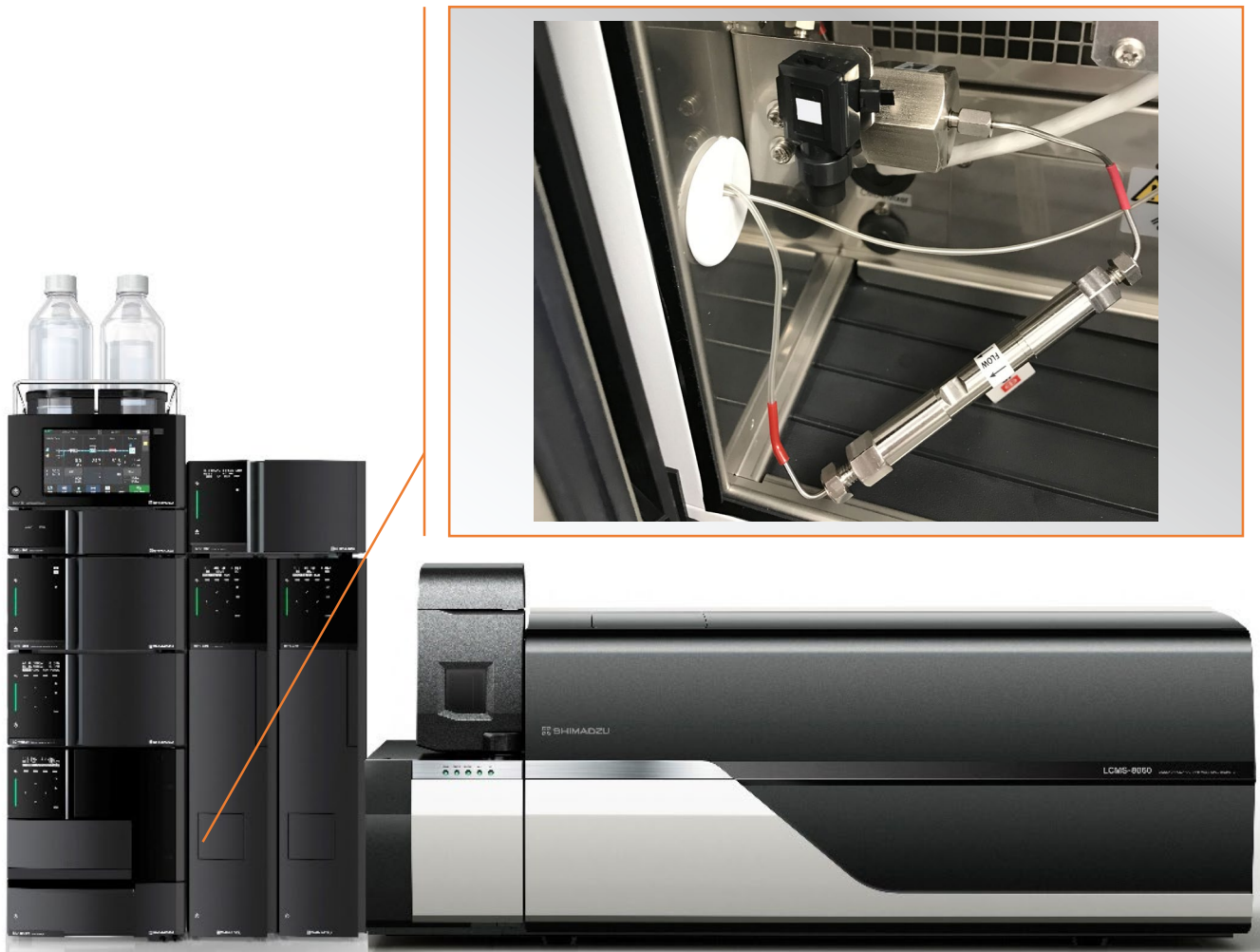
Figure 2: Installation of delay column

Another common practice for the trace analysis of PFAS has been to modify the standard vial and cap selection most commonly used by laboratories. The use of polypropylene vials and enclosures is common, however, polypropylene caps have the disadvantage of not resealing after injection, thus risking compromise to sample integrity.