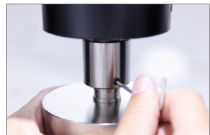
Connect the joint and plate, and fix by screw

For best results, the specimen should be centered along the loading axis of the testing machine.