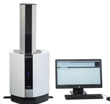
Fig. 2 MALDI-8020 benchtop linear MALDI-TOF instrument

In these applications, the improved biological stability and sequence specificity of the PNAs is utilised as highly selective molecular probes, capable of distinguishing between closely matched but dissimilar sequences found in single point mutations and related inherited clinical disorders. PNAs also have potential application as antisense drugs for HIV-1 treatment.